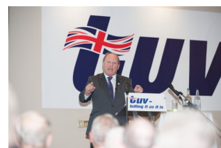
The Annual TUV Party Conference returns to the Royal Hotel in Cookstown. See back page for details.

"This is a matter of great concern to the public and it must be addressed."